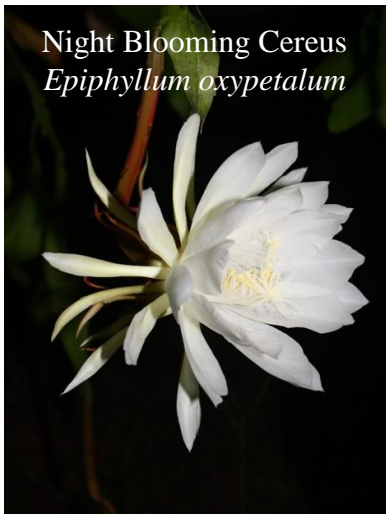
Night Blooming Cereus Epiphyllum oxypetalum

We grow many of our Succulent and Cacti in clay or other heavy pots, as many of them become large and somewhat top heavy with size. Not only that the terracotta pots actually breathe better often leading to healthier plants if they are sensitive to excessive moisture. Many people like to add a layer of sand or rock in the bottom of the pots for weight; it also makes a decorative mulch on top of the soil and aids in stabilizing a newly transplanted cactus while it's becoming established. When repotting cacti or succulents you'll want to use a fast draining cactus mix. To create your own soil mix, add 1 part sand or small gravel to 1-3 parts of a quality potting soil to create this mix. For slower growing plants, select a pot that is the next size up from its existing container (for example: if up-potting from a 6" pot select an 8" pot size). Lower growing plants will generally benefit from a shallow pot (less than 6" deep) over the standard depths, when selecting pots that are 6" in diameter or larger. Many of the trailing and vining types do very well in 6-10" hanging baskets and may trail as far as 6' (i.e. String of Hearts and Trailing Jade) or more in time.